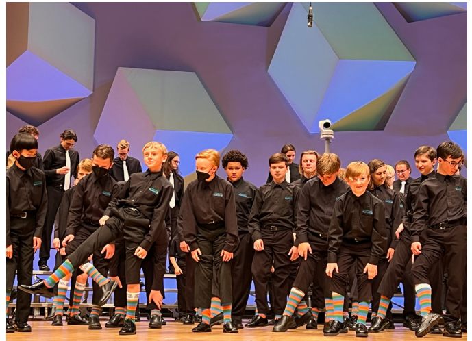
Showing off their Boychoir socks at the Orchestra Hall 60th Celebration Concert

and retirement home concerts, reaching many residents virtually and in-person. Our annual winter concert was shifted to a virtual format (see our YouTube page: youtube.com/mnboychoir), but our spring concerts at Benson Great Hall & Orchestra Hall brought nearly 2000 appreciative audience members back together in person. Our Sing into Spring Gala was both a fun party and a successful fundraiser, netting thousands in general operating support for the organization! Boychoir singers continue to share their gifts with other local arts groups, with two of our sopranos performing in Theater Latte Da's production of La Bohéme and two others in Skylark Opera's production of Amahl and the Night Visitors. In April we threw a party at Great Wolf Lodge in Bloomington for the entire choir... water slides. ice cream and smiles included.